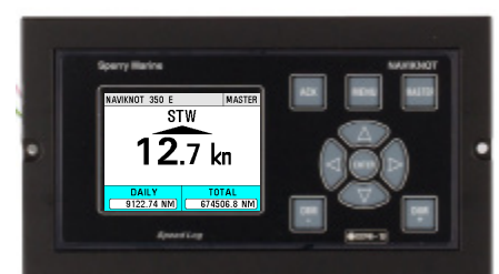
NAVIKNOT CONTROL AND DISPLAY UNIT (CDU) IN A CONSOLE FRAME